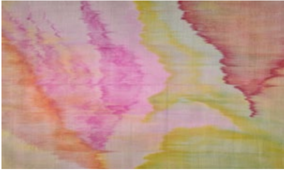
Untitled (P17) , 2009 Silk weaving 41½ x 70½ inches

Reserve Price: $6,000 Estimated Value: $9,000