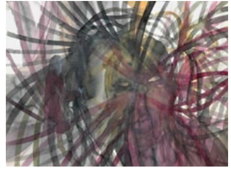
Untitled [figure with butterfly] , 2004 Gouache and watercolor on paper 12 x 16 inches