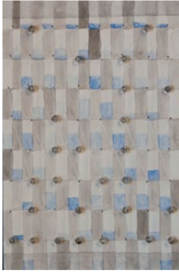
Untitled Thread Drawing , 2010 Thread, graphite, pins, sumi ink, watercolor, gouache, glass beads on board 9¾ x 6¾ inches Courtesy of the artist and Derek Eller Gallery, New York

Reserve Price: $3,000 Estimated Value: $4,500