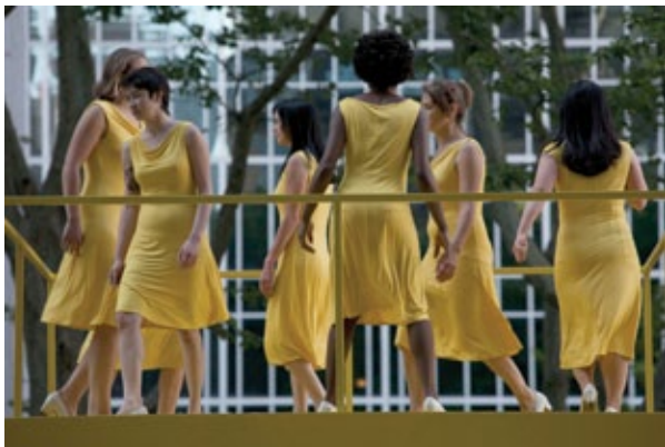
Walk the Walk , 2010 C-print, Ed. 1/10, 2AP 24 x 40 inches (image)

Dimensions listed in inches / Height precedes width