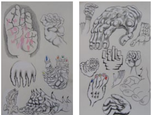
Vegan Hand Study #15 , 2007 Mixed media on paper 10 x 6¼ inches (image)