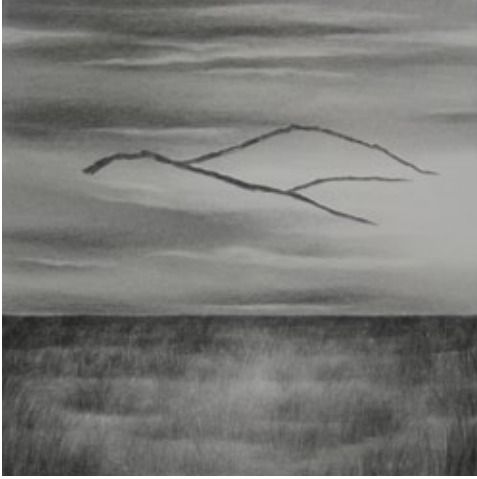
A horrible scream called silence , 2010 Graphite on paper 8 x 8 inches (image size)

Reserve Price: $2,000 Estimated Value: $3,400