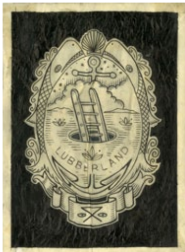
Portal to Lubberland , 2011 Ink on canary paper, photograph, engraved railroad spike. Courtesy of the artist and Magnan Metz Gallery, New York